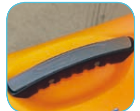
Built in ergonomic handles for easy lifting

The latest edition to the Ocean Kayak range, the Mysto is a stunning little kayak stable, comfortable, easy to paddle, excellent for playing in the surf. With modern lines it's a winner.